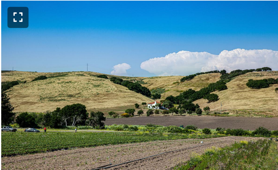
Farm, ranches and vineyards, taxed as agricultural land, continue to preserve the valley's natural scenery near Lompoc, Calif.